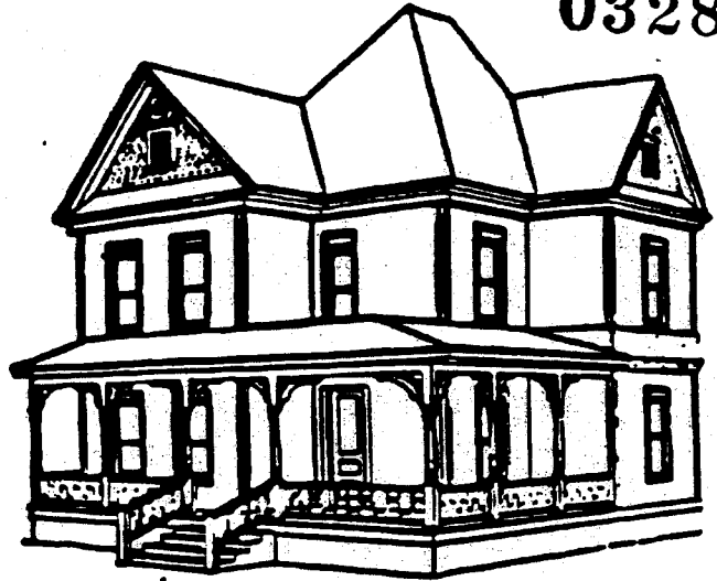
TWO STORY VICTORIAN STRUCTURE