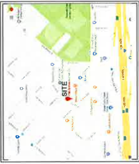
VICINITY MAP NTS

SITE INFORMATION PLANNED DEVELOPMENT DISTRICT NO. 539 MULTI USES 1st FLOOR BUILDING AREA: 5,034 SF TOTAL BUILDING AREA: 20,136 SF PARKING REQUIRED: 15 P/S PARKING PROVIDED: 15 P/S LOADING SPACE PROVIDED: 1SMALL