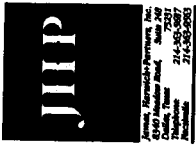
Exhibit 174 A